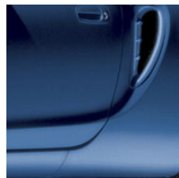
Spectra Blue Mica with Black fabric or Black leather interior